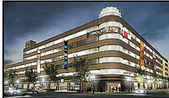
Patriot Equities plans to retain the original facade of the Hecht distribution center on New York Avenue. (Patriot Equities)